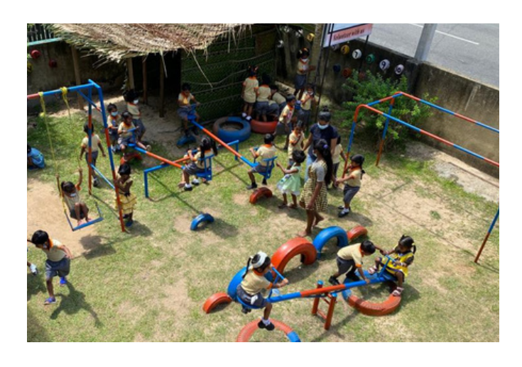
A foundation since 2016 We envision a society returning to humanity.